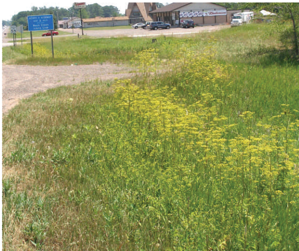
The photo above is typical of what you might find along an infested roadside.

This population is too large to hand-cut or pull, a power mower should be used before the seeds set. Plants may re-sprout when cut above the ground, and should be cut again or sprayed, a few weeks later to prevent flowering. Cutting done after seed set will greatly reduce the likelihood that the plants will be able to re-sprout and flower, but will increase the risk of spreading the seeds and creating new problems. Plants cut at this time must all be gathered and destroyed to prevent mature seed from developing and falling to the ground. Another effective way to eliminate reseeding is to hand-collect all seeds after they have set. If control of flowering or seeding plants is carried out over several years, the population will decrease as the seed bank is depleted. If mowing Wild Parsnip, be careful cleaning the equipment as the sap will still be present. It's suggested to clean the mower deck, if mowing while seeds are present and before traveling to the next area or the equipment storage area.