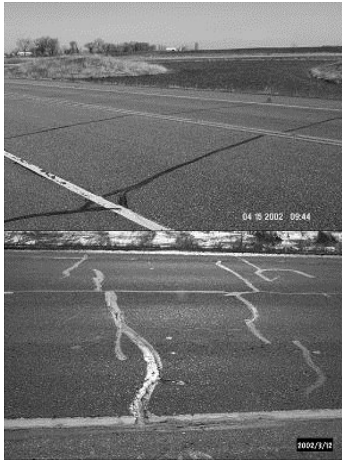
Figure 2. Typical thermal cracking patterns on PG 58-28 (top) and PG 64-22 (bottom) test cells at MnROAD (Clyne et al. 2006).

In addition to noting important environmental and material data along with their observations, from the outset MnROAD engineers have recorded these observations in light of possible research topics: for instance, MnROAD proposed the necessity of load-related inputs for thermal cracking models by observing that in many cases more thermal cracks developed in the right (driving) lane than in the left (passing) lane in the mainline sections. A number of test section assessment reports by Palmquist, Worel et al., Palmquist et al., and Zervas describe in detail the damage done by the Minnesota's climatic extremes.